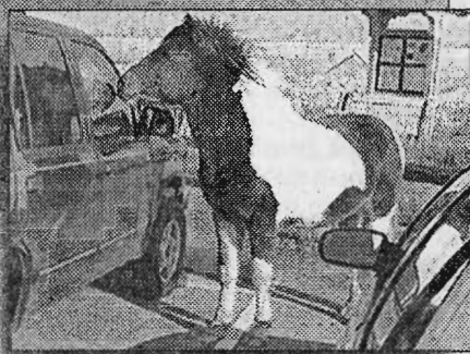
BY JEANNETTE BELLIVEAU—THE WASHINGTON POST

...y in the ...the boardwalk ...and view ...close range.